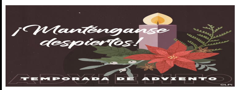
Words and music used with permission. CCLI License #1680760 is printed with copyright permission. All rights reserved. Reprinted under ONE LICENSE A-706032

A unque parezcan tus pasos inútil caminar, tú vas haciendo caminos: otros los seguirán.